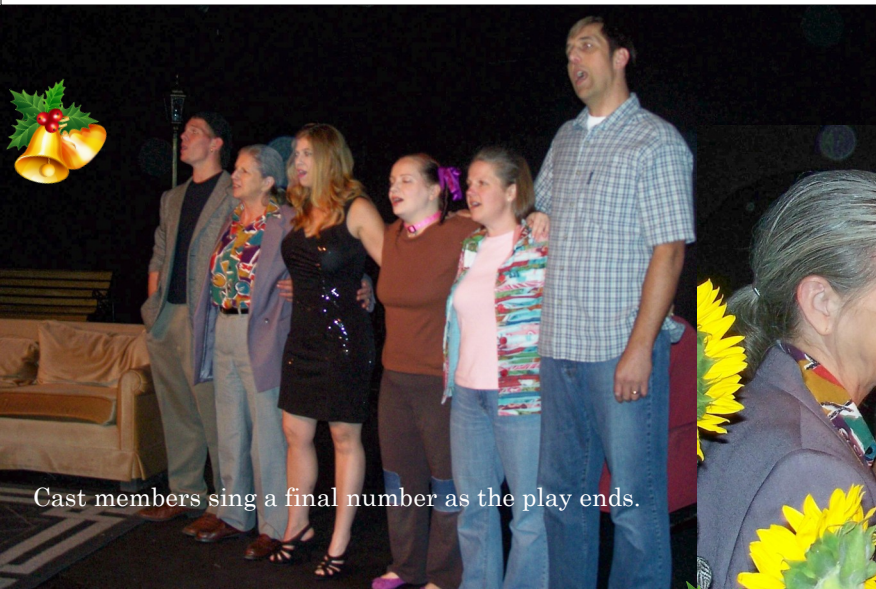
Cast members sing a final number as the play ends.