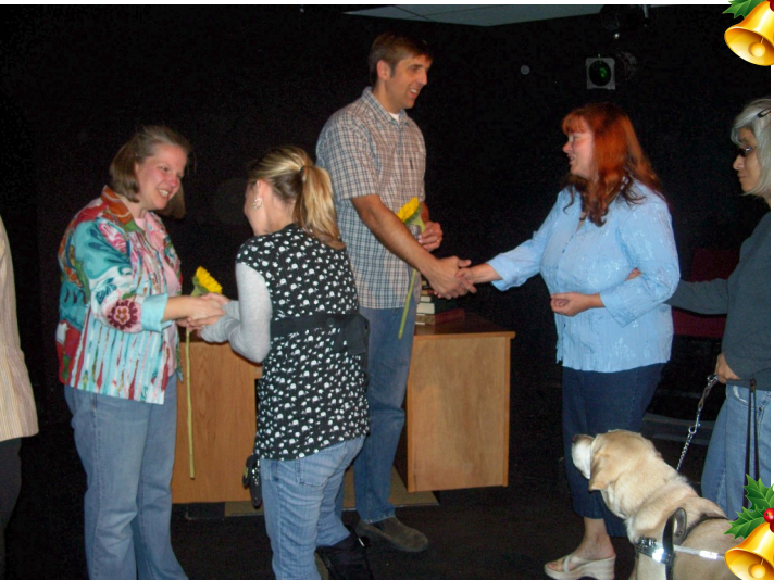
Audience members meet the cast and thank them for their generous contribution of time and talent!